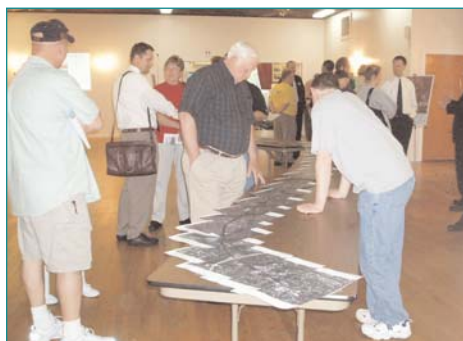
Local residents review project details at a public meeting.

In addition to viewing the community through the eyes of its members, you can also ensure that your outreach methods meet the needs of the community by using your contacts, hosting public meetings, taking surveys, and publishing newsletters. From your previous background gathering, you may also know that a portion of the community has Limited English Proficiency (LEP); therefore, it may be necessary to provide translated materials to those individuals. If there are a lot of shift workers in the community, staggering the public meeting times to ensure maximum attendance can increase participation.