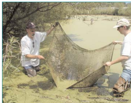
Surveying Wetlands for Threatened and Endangered Amphibians

As environmental consultants, it is our goal to work cooperatively with our clients and with regulatory agencies to coordinate the needs of the client with the enforcement of natural resource regulations. These regulations are in place to provide protection of vital biological and natural resources for the benefit of the environment. When a proposed project conflicts with a natural resource of concern, we provide the information and expertise necessary to avoid or minimize impacts to the resource.