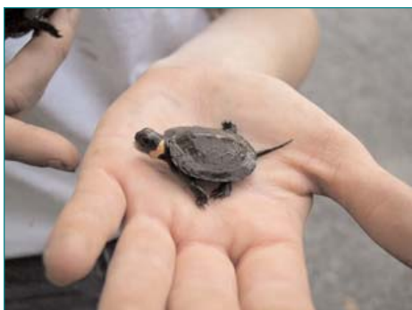
A Juvenile Bog Turtle

Habitat management is basically a matter of being aware of the effects humans will have on the environment and adjusting our land use based on a value placed on that environment. With expanding populations and the growing use of resources, it is often