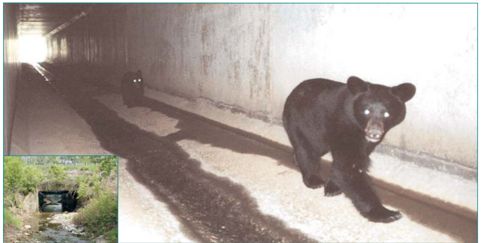
Rush Hour - Wildlife Underpasses Are One of Many Strategies Employed to Preserve Wildlife in Areas of Development

In a sense, wildlife management is more of an art than a science. The conventional definition