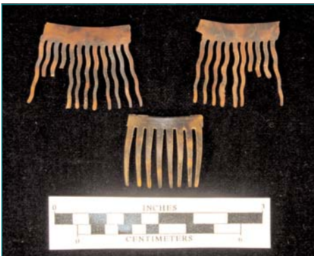
Celluloid Hair Combs

assortment of ceramics, glass fragments, kaolin pipe stem and bowl fragments, a gun flint, a small lead shot, and architectural debris, in a fill horizon approximately 1.5 feet below the ground surface. The ceramic collection, which dates roughly from 1730 to 1775, includes Chinese export porcelain, creamware, English or German stoneware, and Jackfield ware, all of which are usually found in upper-class households. A test unit placed in this area exposed a mortared rough-cut stone foundation as well. It is believed that these artifacts and foundation remains are part of the domestic occupation of the rough-cast dwelling Richard Cooper and his wife moved into in 1798.