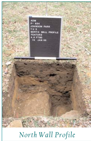
North Wall Profile

B elow the paved street surfaces and open lots, the archaeological record of Camden's development offers a unique cross-section of the city's ethnic background, engineering feats, neighborhood growth, and consumer patterns. In the case of the Cooper's Ferry Development Association (CFDA), the archaeological undertaking in Johnson Park proved to be a cultural and historical surprise. The CFDA, in conjunction with Rutgers University, has proposed to restore Johnson Park, home of the National Register-listed Cooper Library, to its original early-1920s setting. The proposed improvements include: the restoration of an ornate fountain and wading pool complex fronting Cooper Street, planting of trees in the surrounding park, new sidewalks, the installation of thematically appropriate lighting along the sidewalks, and the installation of a new handicap ramp on the north side of the building to allow full wheelchair access to the building's interior.